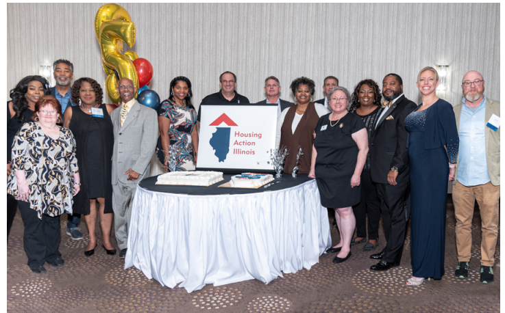
Housing Action Illinois Board of Directors

View presentation materials and photos »