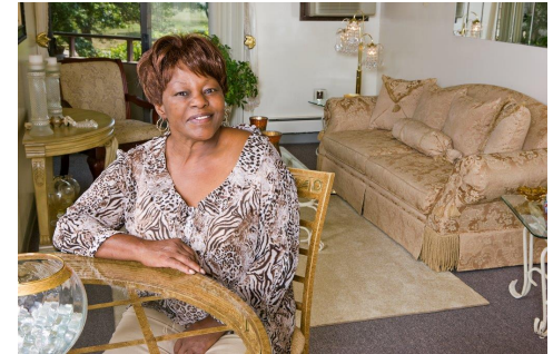
Tenant who was assisted by NI ReACH

Read more in this month's Member Spotlight »