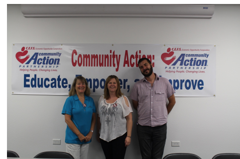
Housing Action and C.E.F.S. staff visit during 2017 Housing Action Caravan