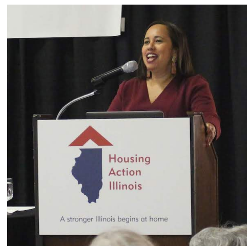
Illinois Deputy Governor Sol Flores at 2019 Housing Matters Conference