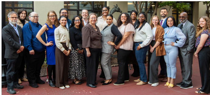
Housing Action's staff at our 2025 Housing Matters Conference